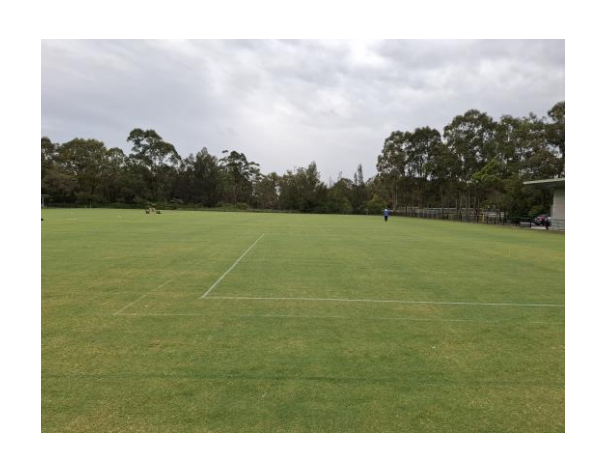
Views from Toronto Croquet Club