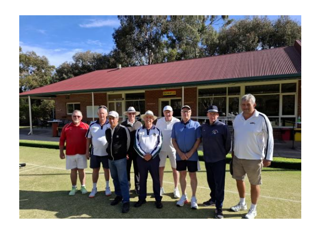
Competitors SA Men's Spring Singles