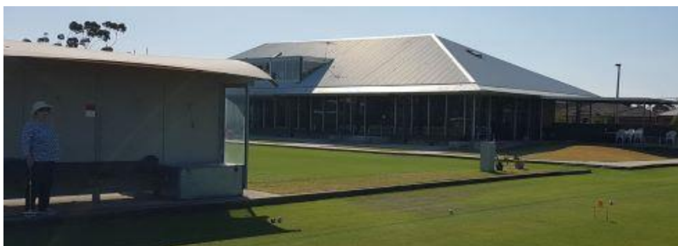
Club House at Cairnlea Victoria – Gateball State Championships of Victoria 2024