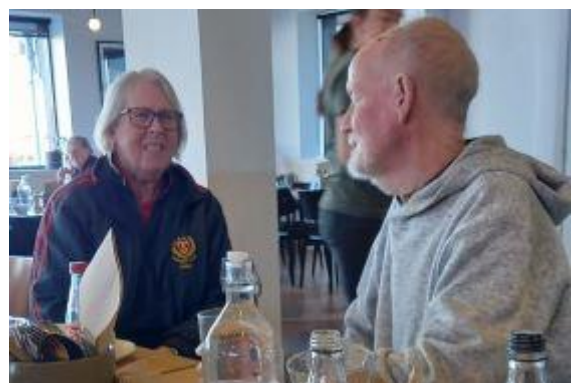
Club Members enjoying lunch together at The Metro on Anzac Day